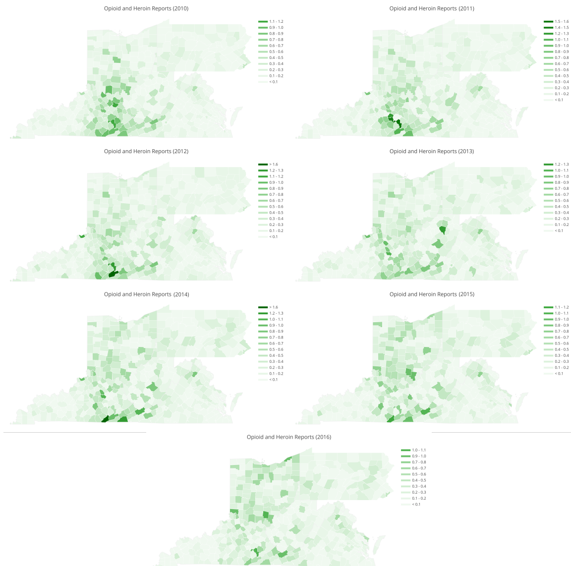
Figure 3: Spread of the opioid crisis from year 2010 to 2016. The legend tells the number of drug reports per 100 people in each county. A darker green indicates a higher number of drug reports per 100 people.